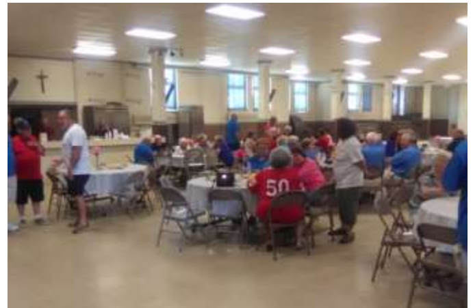
Building Fraternity with our Massachusetts Brothers & families at the post game meal.