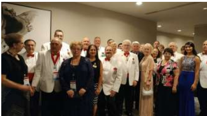
The members of the RI Delegation, the Order's First State Council.

This year's State Pin was well received (it is a beautiful design), below is an image of it (Mary holding the Child Jesus):