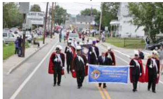
Fr. Donahue Assembly with Fr. Boehr Council Knights & Columbiettes at Tiverton Pride Day, honoring the town's First Responders

area. The Sir Knights of Donahue Assembly, along with the Knights & Columbiettes of Boehr Councils helped to honor Tiverton's First Responders. Thank you for your witness.